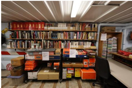
Bill is fine tuning our Library.

We are always concerned about our security. Swav Kojro has been installing video cameras to be able to observe our building when we are not there.