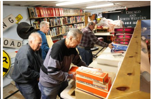
From Walter's house to the CLRC Train House we ultimately moved the collection to the mezzanine level.