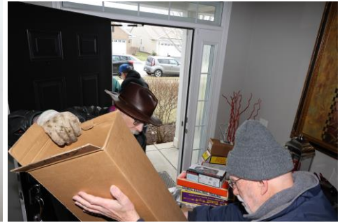
A bucket brigade was started from the basement, all the way to the waiting cars.