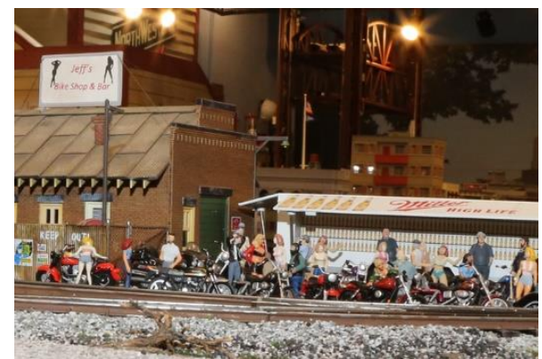
Jeff's Bike shop and Bar