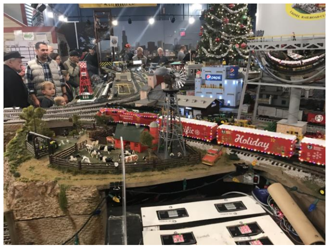
The clubhouse decorated for the holidays

Thank you to the members who braved the foul weather to ensure our visitors had a great time. Without your efforts, events like these are not possible.