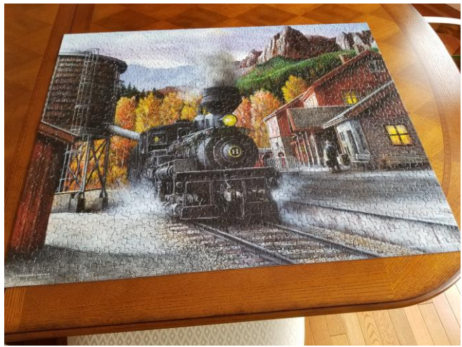
Joe Smolinski works on train puzzles