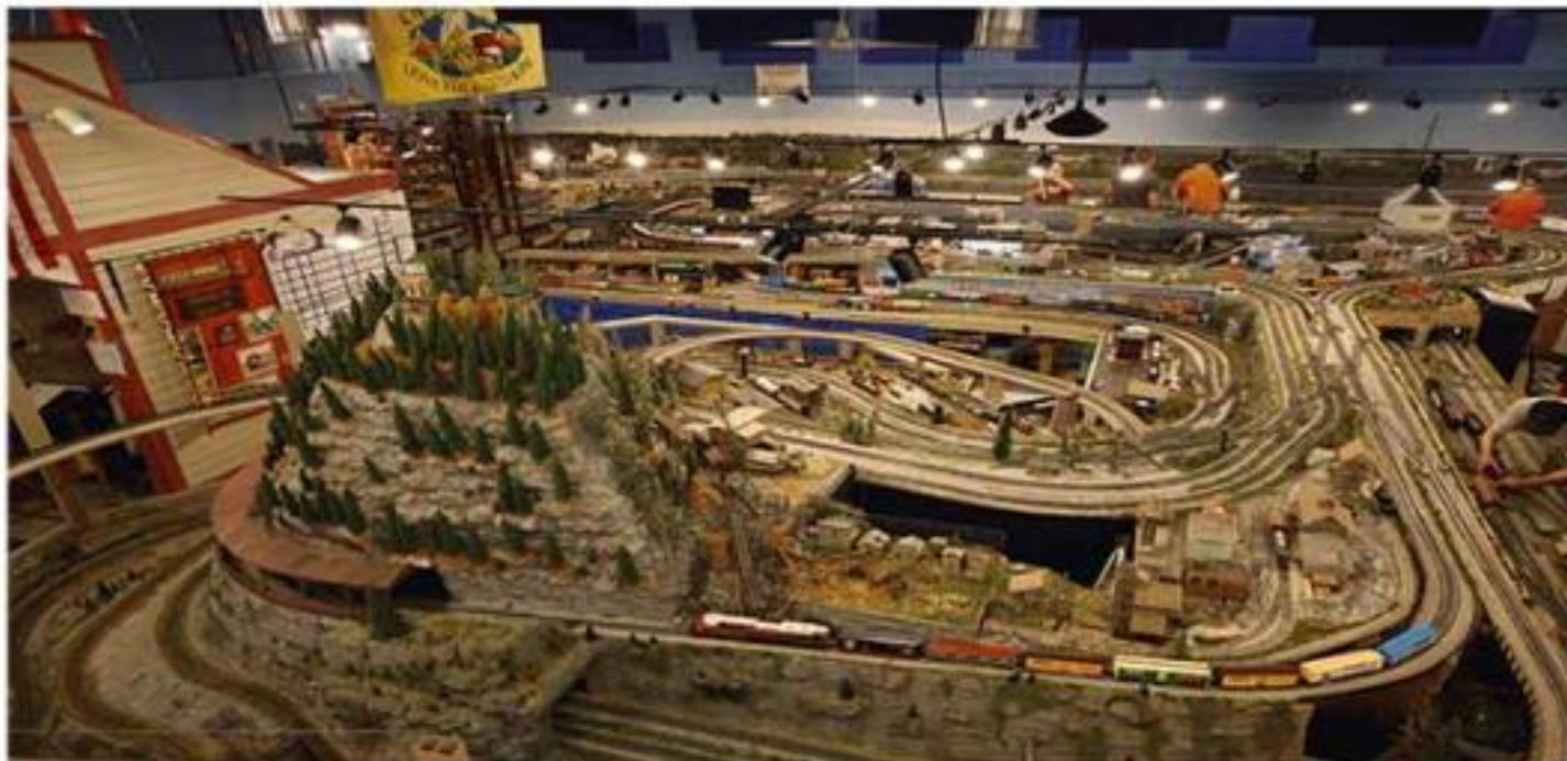
A Bird's Eye View of the CLRC Layout.