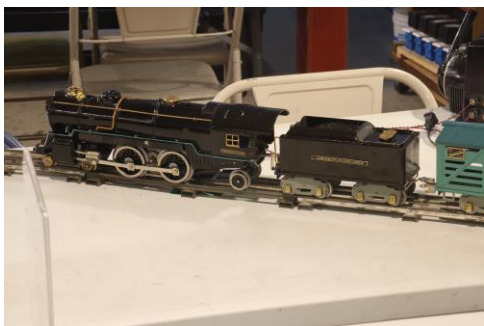
Powerful AF Engine