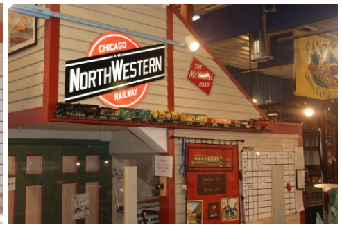
What a super train display