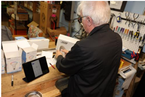
Lights are being programmed