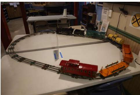
Pristine AF Standard Gauge Train