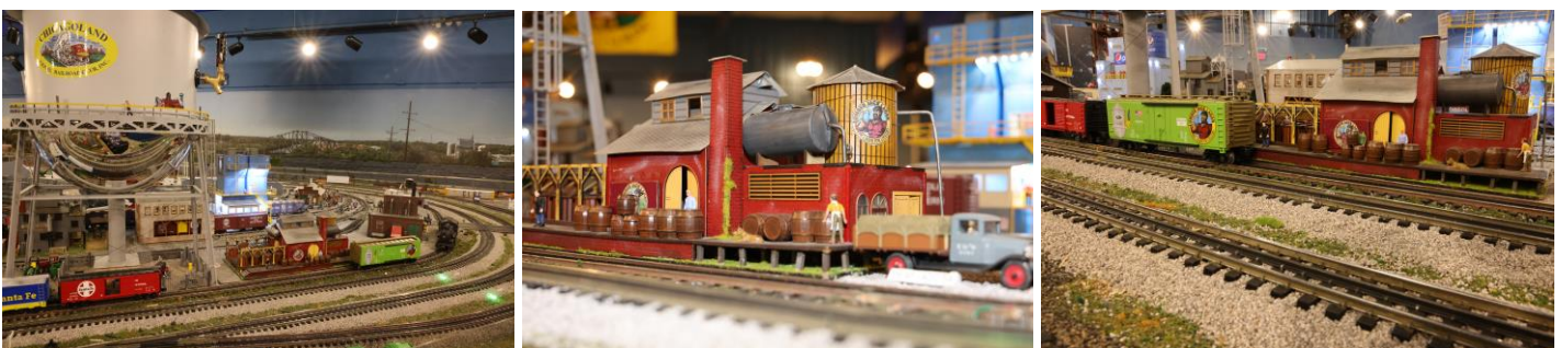
The water tower high above the Brewery.