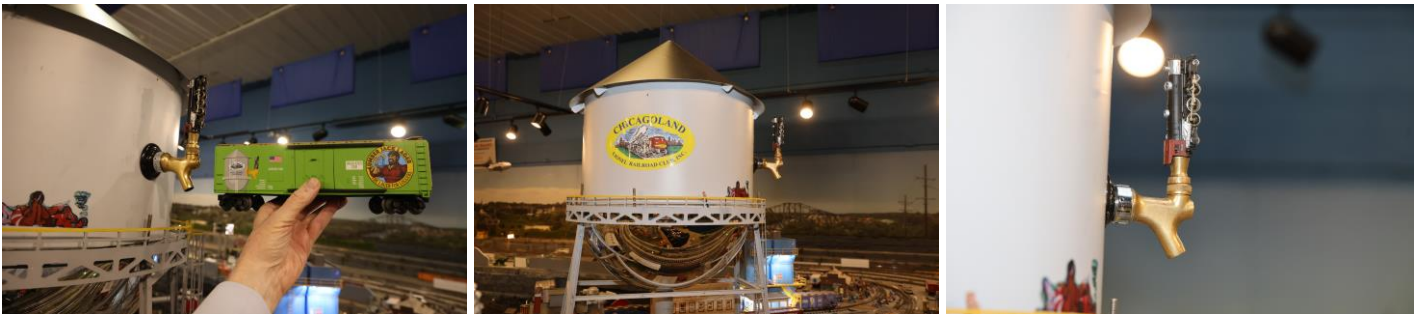
Here is the evolution of having the Lumber Jack Lager Tapper image on the car go to our CLRC water tower.