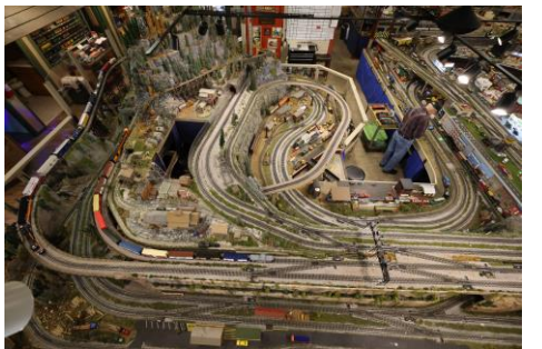
A nice view from above.