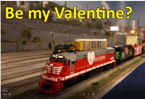
Valentine's Train for Open House.