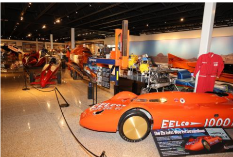
Museum of American Speed