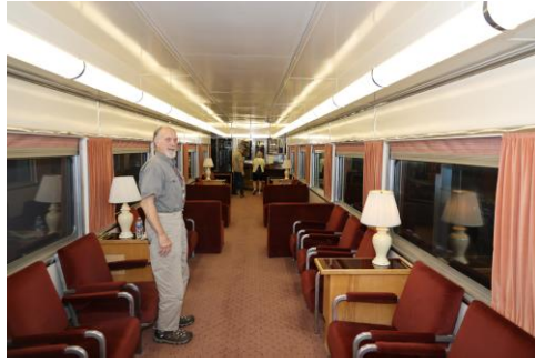
UP Museum Passenger Car Exhibit