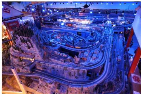
Our layout bathed in blue lighting

Other Blue Lighting nighttime views, where one can see the blue lighting compliment and fill the normally poorly lit areas with a nice wash of blue.