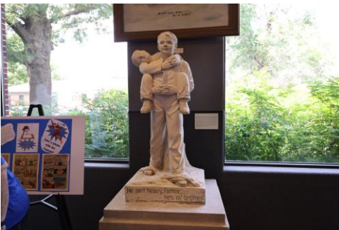
Boys Town, "he ain't heavy"