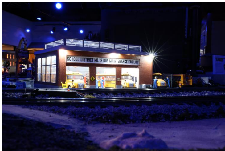
Nighttime with Blue Lighting

Other Blue Lighting nighttime views, where one can see the blue lighting compliment and fill the normally poorly lit areas with a nice wash of blue.