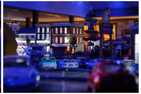
Spindle next to the McDonalds