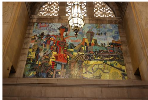
Capital Golden Spike Mural