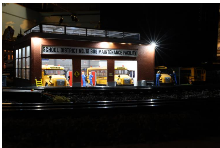
Nighttime with building lights turned off

Let's start out with an update on our Nighttime lighting. Swav Kojro can change our lights to blue which gives a nice stage nighttime lighting. Many of our areas are illuminated with buildings, streets, and other lighting sources. The blue light is just enough to compliment these areas and lightly illuminate the surrounding areas with a nice nighttime glow. Swav is prepared to turn on the blue lighting at our next open house. Will it be hourly? Every other hour? Who knows, but it will be blue at some point. Lets see how it evolves. To further illustrate the beauty and strength of using blue lighting the left picture is with the lights turned off. The right picture is with blue lighting only. One can see how more of the foreground is visible. It makes for a nice rich lighting. Kind of lighting one gets with the full moon. Regarding the isles, we observed that they are visible under the blue lighting.