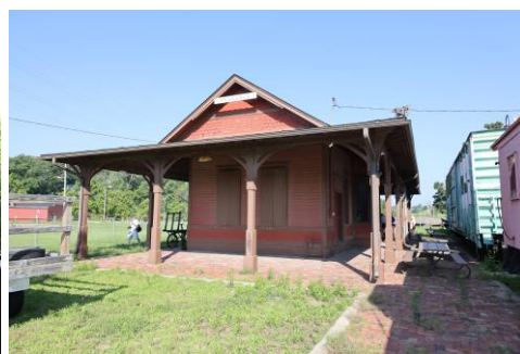
Florence RR Station with "Girls Cars"