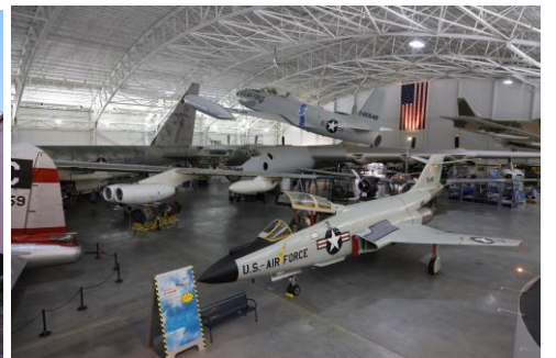
SAC (Strategic Air Command) Museum