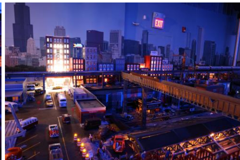
Chicago at 10:00 pm