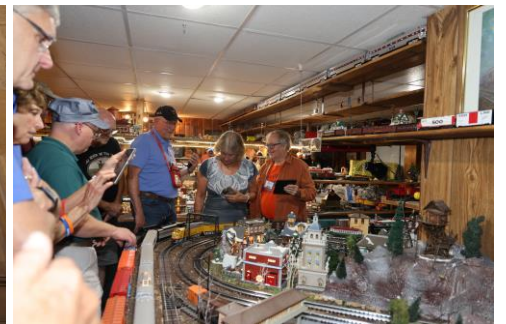
LCCA Members Layout Tour