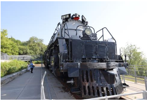
The Big Boy at Kenefick Park