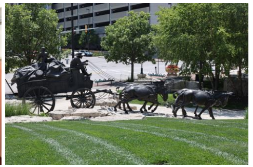
Mile long Omaha Wagon Train Exhibit

LCCA Tours – Mormon Memorial, Florence Bank, Mill, and Station, Boys Town and SAC Museum https://www.youtube.com/watch?v=s2u1BTXArdo&t=6s