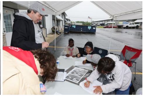
Scouts learn about Trains, how they work, putting together a train trip, types of RR cars, and much more.

Lunchtime went quite well under the tarps we set up earlier. At the end of the day, Merit Badge Counselors met with the Scouts to review and confirm that they earned the Merit Badge.