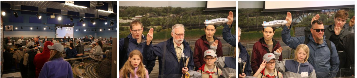
Scouts gather inside for the opening ceremony and an overview of what to expect for the day

Saturday started out with a heavy overcast during registration. Everyone went inside for the opening ceremony and the overview of what to expect for the day.