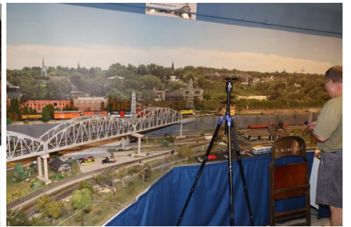
Bill works out the kinks to the run.

Swav Kojro advised that the old variable light switches were not compatible with the new multicolored lights causing them to constantly blink. Tom Zeglicz installed new compatible light switches. The lights are stable and can be programmed for the super sunrise to sunset light show. Next Tom installs some multicolored lights.