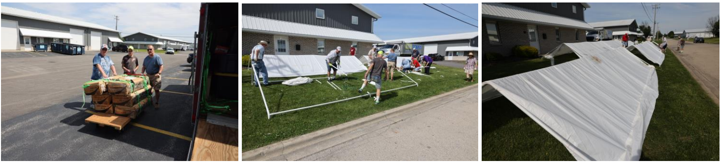
Club members assemble the tarps needed for the Railroading Merit Badge

The first Saturday of June is when we hold the Railroading Merit Badge for the Scouts in the Midwest. We had nearly 100 Scouts registered and over 90 earned the merit badge. We start on Friday to set up the tarps for sun and rain protection.