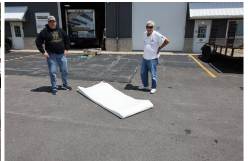
The Registration Tarp and all of the rest of the tarps are dried, folded and put away for the next activity.

Bill Trzaskus coordinated receiving about 40 (very brittle) New York Central Railroad Co. drawings of their Chicago, ILL track plan. Joe Smolinski, Pat Good and I took pictures of the prints for our records. As you can see, the resolution of the pictures are quite good. When you zoom in, you can make out details. The pictures will be available on our CLRC computer. Please coordinate with Jeff Mills if you would like to view them.