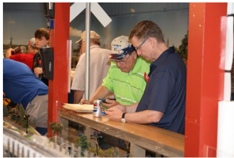
Engineers get ready