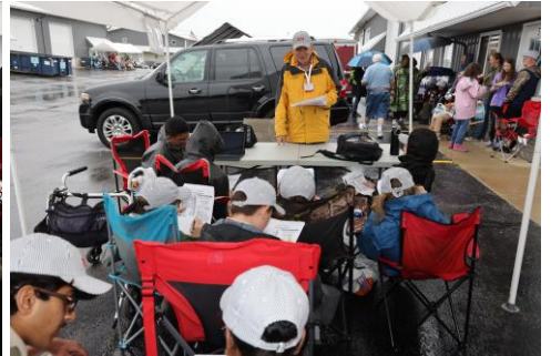
Lunch was good. Scouts continued to work on the merit badge after lunch.

On Sunday we came back and dried off the tarps so they would be in a good condition for next year's June 7, 2025's Railroading Merit Badge Day.