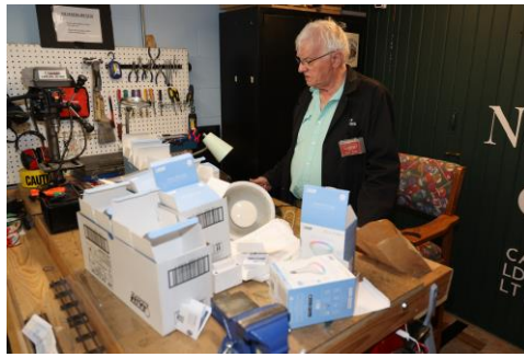
Swav programs new lights