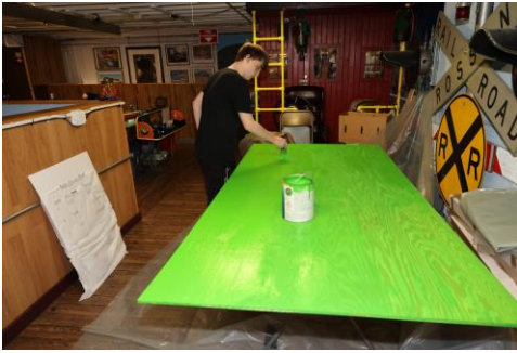
Seth paints plywood deck

Seth Dodge continues his development of the new HO layout. Here he is setting up the 4' x 8' plywood deck with our green paint. Swav Kojro is programming variable-colored lights for daytime/sunset/nighttime lighting. Looks promising. Nick Pucel is hard at work fixing trains from members and customers.