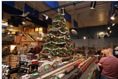
Big Christmas tree on the layout