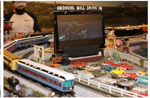
Grovers Mill Drive-in showing Polar Express