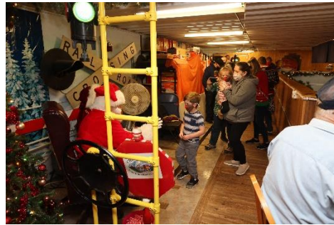
Lining up to see Santa