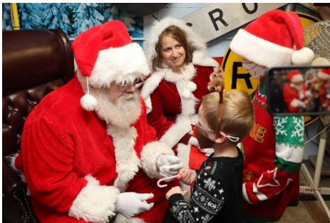
Santa, Mrs. Claus and guests

It is truly nice to be at a CLRC Christmas Open House. Members and trains are decorated in full Christmas Spirit. Santa and Mrs. Clause came in and shared their time with us and our guests. Santa and Mrs. Clause are a real delight. I watched in a corner as he interacted with a young girl who was scared to see Santa. (I did not know that this was possible but saw many who had that concern.) Santa got her attention with a friendly smile and a hello. She ended warming up to him and enjoyed sharing her wish list. At the end of the day, we thanked the Clauses with some bubbly for their New Year's celebration.