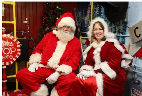
Santa and Mrs. Claus