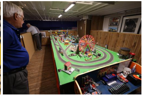
Joe continues with the Sodor Layout.