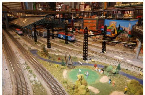
Bill makes good use of his talents to bring the catenary system into the Union Station Yard